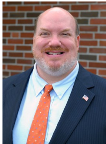
State Senator Don Humason (R, 2nd Hampden and Hampshire District)

On February 26, 2017, at 11:30 am , Congregation Sons of Zion (378 Maple St., Holyoke) will host State and Local politicians for a moderated discussion entitled, “The United States Under a Trump Presidency: What it Will Mean to Greater Holyoke.”