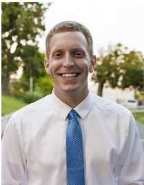
Holyoke Mayor Alex Morse